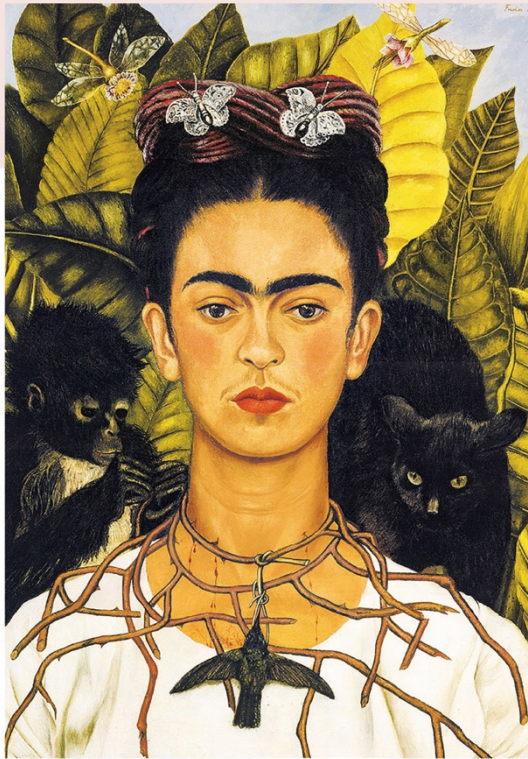
Self-Portrait with Thorn Necklace and Hummingbird, 1940, Frida Kahlo

The Mexican artist Frida Kahlo (1907 - 1954) is most celebrated for her self-portraits. She painted dozens of them in her lifetime and often used symbolism to describe her physical and mental state. Kahlo made great use of Mexican imagery to illustrate her work.