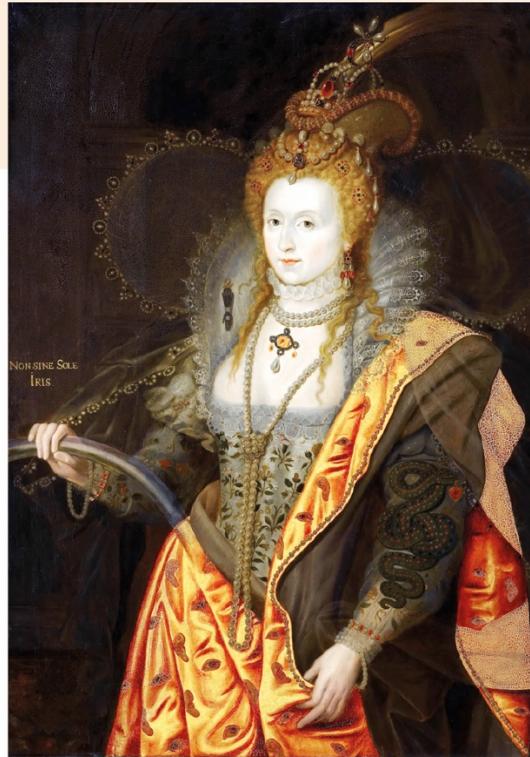
The Rainbow Portrait of Elizabeth I. C.1600-1602 by Isaac Oliver or Marcus Gheeraerts the Younger

This painting is referred to as the The Rainbow Portrait because it shows her holding a rainbow in her right hand.